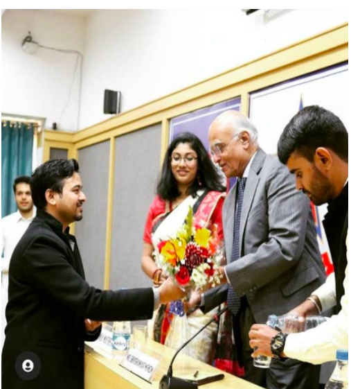
Table of Speakers