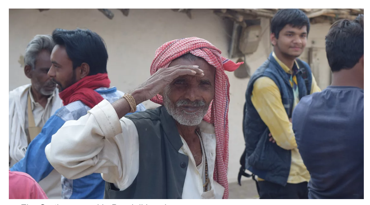
Fig: On the ground in Bundelkhand

The Centre of Economic Research organised a Rural research program between 17th March 2019 and 24th March 2019, 4 teams of students were set out to four areas affected by the agrarian and farm crisis and undertook primary research to understand and analyse the ground level situation. The surveys were conducted in Telengana, Mansa in Punjab, Vidharbha and Bundhelkhand. Total number of students involved were 70(on field and off field together).