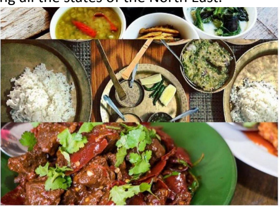
ST STEPHEN'S NORTH-EAST SOCIETY