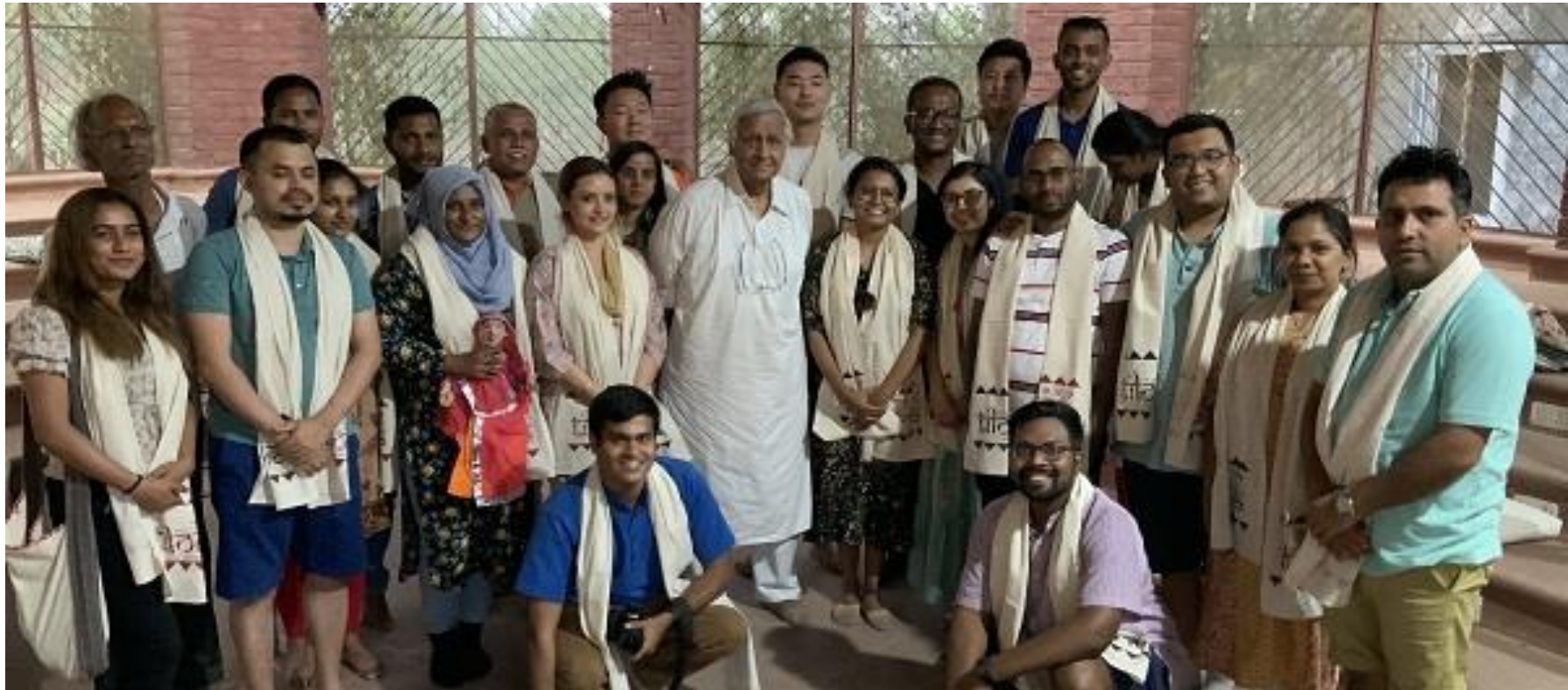
The first batch of YLNF Fellows with Sanjit “Bunker” Roy at Tilonia in Rajasthan