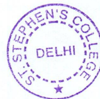
PRINCIPAL ST. STEPHEN'S COLLEGE DELHI-110007