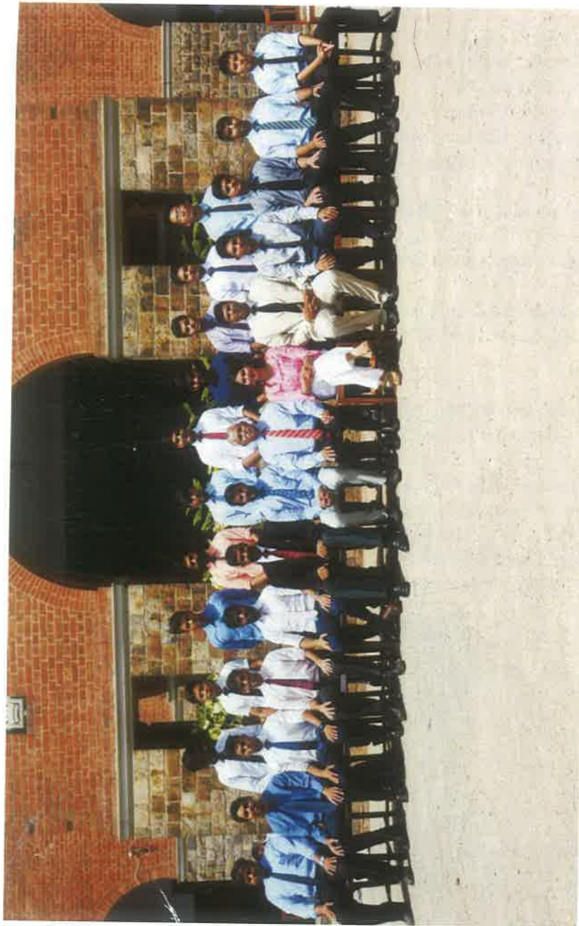
St. Stephen's - Team FOOTBALL (Men)