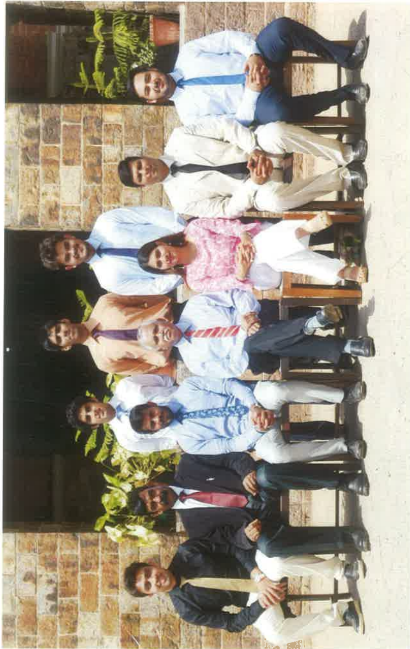
St. Stephen's - Team SQUASH (Men)