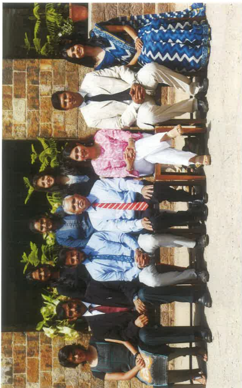
St. Stephen's - Team BADMINTON (Women)