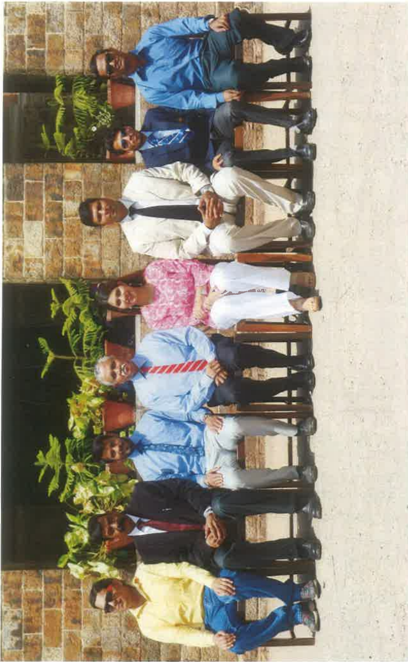
St. Stephen's - Team PARA ATHLETICS