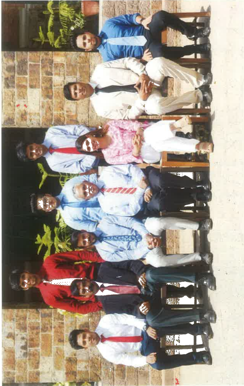
St. Stephen's - Team TABLE TENNIS (Men)