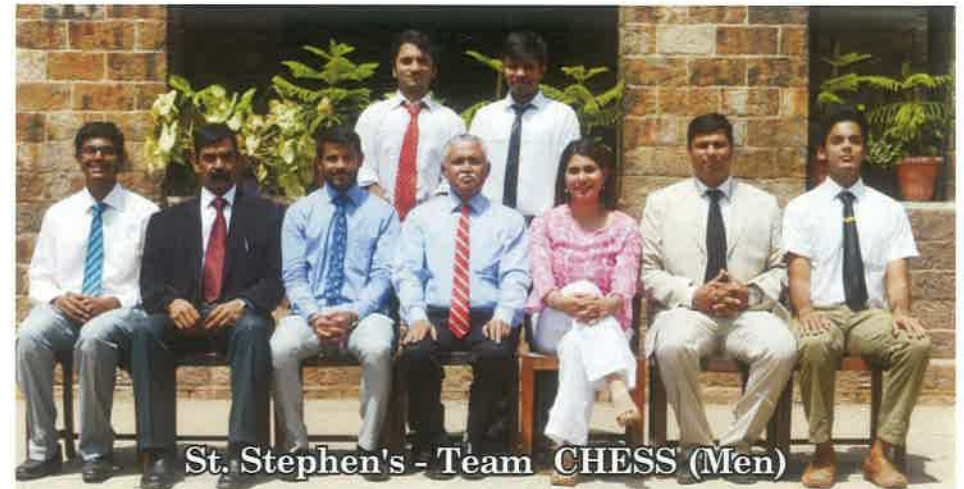
St. Stephen's - Team CHESS (Men)

With a total of 8 points on 12, the College Chess Team was tied 4th in the Inter-College Tournament.