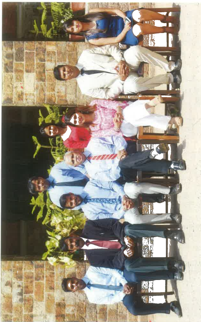
St. Stephen's - Team LAWN TENNIS