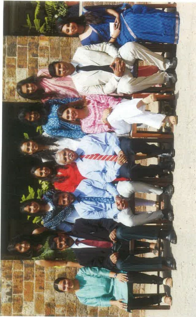
St. Stephen's - Team BASKETBALL (Women)