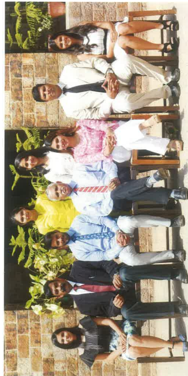
St. Stephen's - Team TABLE TENNIS (Women)

• At the annual Squash Championship organized by IIT-Delhi held on 25th-27th February, 2016, the St. Stephen's Squash team won the Gold medal.