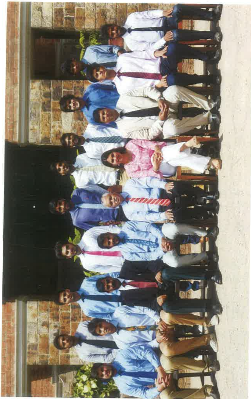
St. Stephen's - Team BASKETBALL (Men)