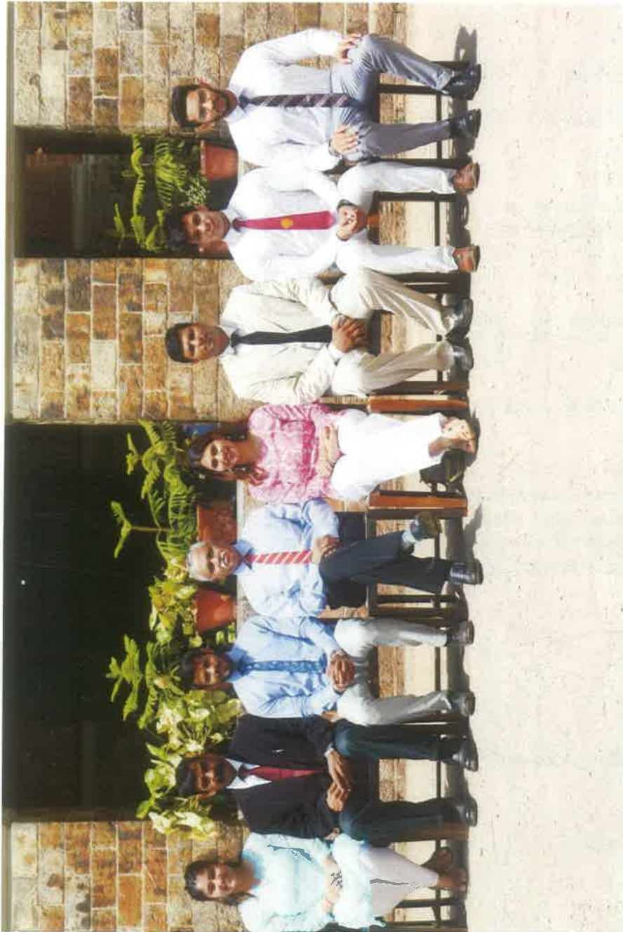
St. Stephen's - Team AQUATICS (Men &amp; Women)