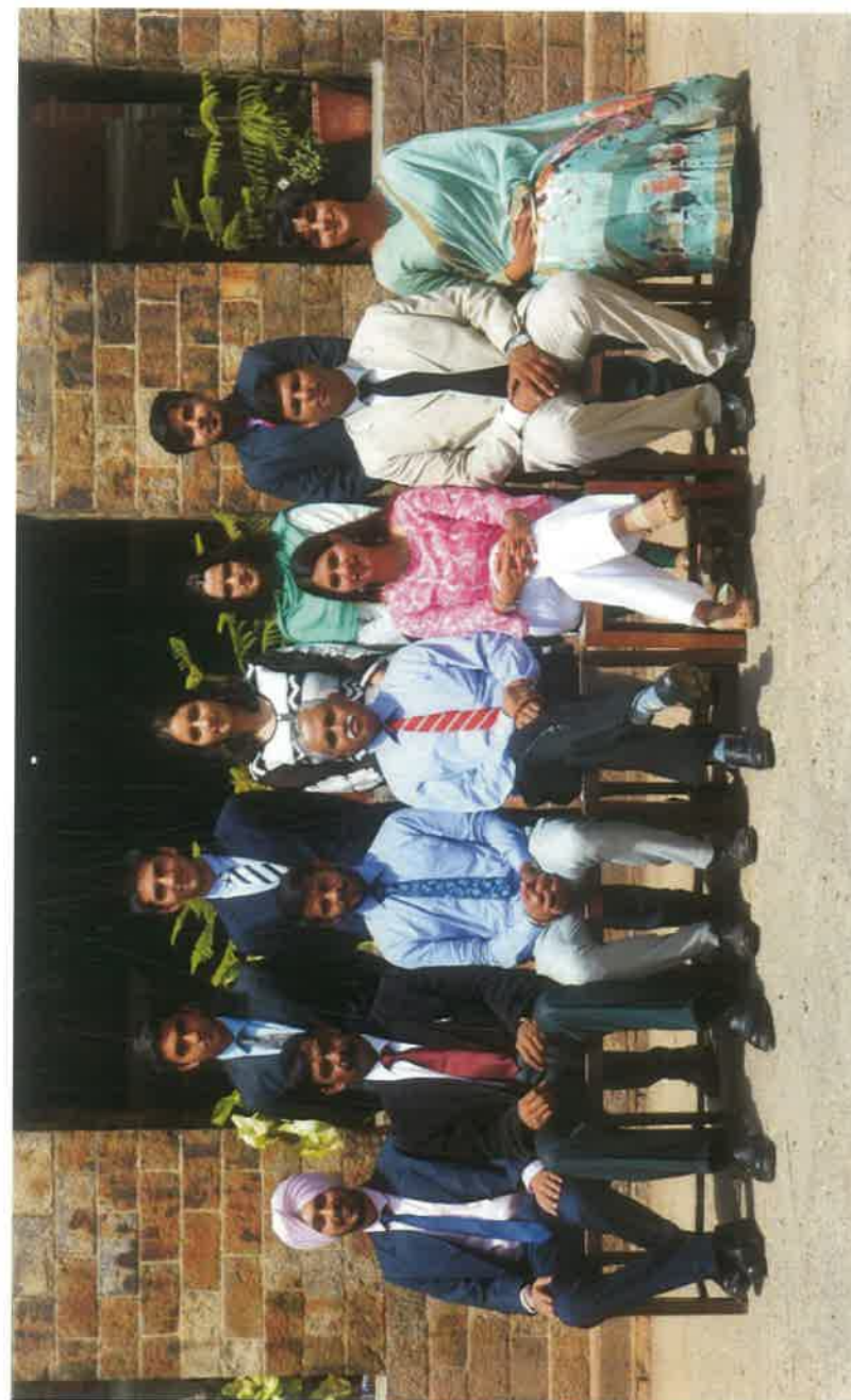
St. Stephen's - Team SHOOTING (Men & Women)